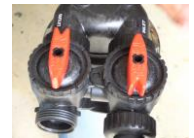
Bypass off, water flows through tank