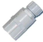
Hose Bib Assembly