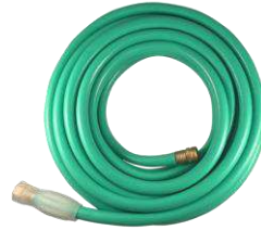
Lawn Hose Connected to Faucet