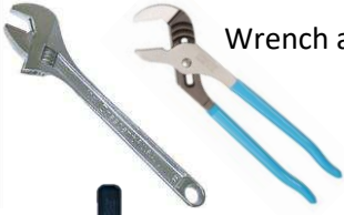
Wrench and Pliers*