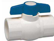
1-Inch or 1.5 inch PVC Shut Off Valve*