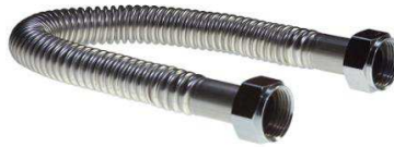
1-inch or 1.5 inch (24-inch Long) Corrugated Water Connectors (x2)