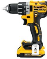
Drill with 3/16" drill bit*