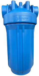
Prepped Pre-Filter Housing

This step will require the materials listed below