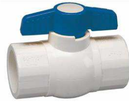
1-Inch or 1.5 inch PVC Shut Off Valve*