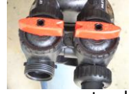
Bypass on, water does not flow through tank