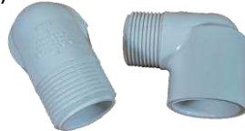
1-inch threaded connectors for pre-plumb (slip/threaded elbows shown)